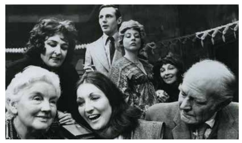
Can you spot a future Hollywood star? This intriguing photo is from a new digital online exhibition from the James Hardiman Library, marking fifty years since the opening of the new Lyric Theatre in Belfast. The Lyric's archives are held in the University and are a rich resource for theatre scholars.